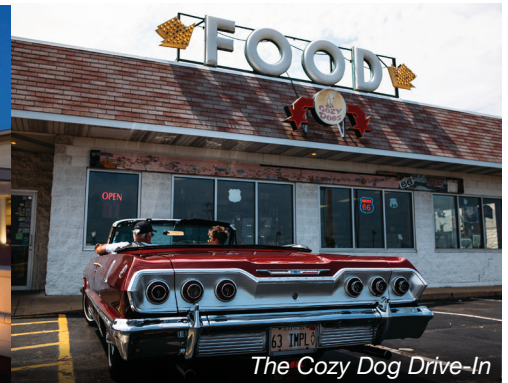
The Cozy Dog Drive-In

It's ALWAYS LEGENDARY when Abraham Lincoln or Mary Todd steps on your tour bus!